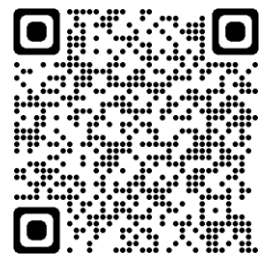
Termite University Website QR Code