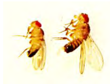
Drosophila melanogaster male (left) and female laying egg (right).

If you have ever waited just a little too long to eat your bananas and they have reached the optimum sweetness for use in banana nut bread, then you have met Drosophila . Those annoying red-eyed gnats, commonly called fruit flies or vinegar flies, that you may first notice in your kitchen sink have proved phenomenally useful in biological research because they are easy to care for, breed quickly, produce a lot of eggs (high fecundity), have a life cycle of about 30 days, exhibit sexual dimorphism (easy to differentiate males and females), are easy to anesthetize (with CO 2 or by chilling), have only four pairs of chromosomes, and their complete genome (genetic information) has been sequenced (determined).