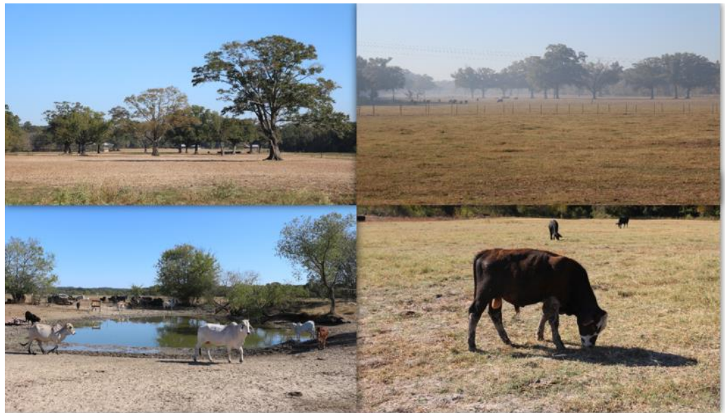
Figure 1. Drought has impacted forage establishment, grazing potential and water availability and quality.

Lack of moisture can impact forage establishment, especially with annual ryegrass and clovers. Due to the lack of rain, using a combination of small grains, annual ryegrass and clovers could help increase the forage potential. Small grains tend to have better drought tolerance during establishment (Fig. 3). It is advised to plant in a prepared seed bed instead of sod seeding to speed up establishment and minimizing delay in grazing opportunities. A preliminary study at Mississippi State has indicated that planting into a summer grass sod (bermudagrass or bahiagrass pasture) can delay grazing by 4 to 6 weeks compared to prepared seed bed. To speed up the establishment of winter grasses, producers will be tempted to apply the fertilizer (especially nitrogen) along with the seed. It is recommended to wait until the seed has germinated and they are about two to three inches before applying nitrogen to increase the opportunity for better use efficiency by the new seedlings. A nitrogen rate of 30 to 40 units of nitrogen (e.g. 65 to 90 lbs of urea or 90 to 120 lbs of urea ammonium sulfate) should be sufficient for the first two grazing cycles and repeat fertilization to increase forage production into the spring.