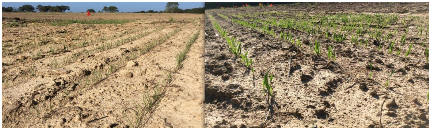
Figure 3. Selecting crops that can have strong seed vigor during drought conditions are important to ensure better establishment and recovery. Annual ryegrass (left) and cereal rye (right) three weeks after planting in Smithdale, MS. Plots planted on September 1, 2015.

4). Although the poisonous plants might not increase in density, they have tendency to maintain productivity and be selected by the livestock due to higher sugar levels and quality than dead or dormant grass. One reason for increased toxicity problems is that there is less (if any) residual carry-over forage to buffer the toxins. It is important to scout your pastures and shaded areas for poisonous plants that can have favorable environmental conditions to allow them to grow and reproduce.