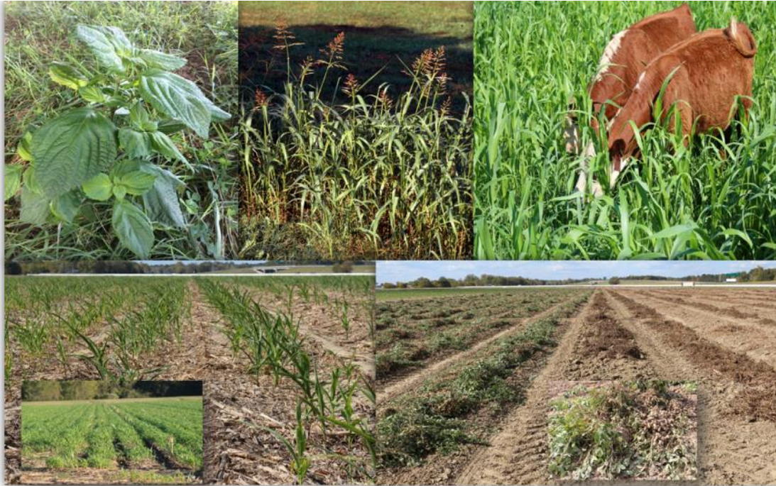
Figure 4. Forage that can impact animal health due to toxins, prussic acid accumulation or low quality and high ash content: (a) perilla mint, (b) Johnsongrass, (c) sorghum/sudangrass, (d) corn regrowth, and (e) annual peanut residue.

Forage producers in several Mississippi Counties may qualify for the Livestock Forage Program due to extreme drought conditions, which is based on the U.S. Drought Monitor. The counties include Hinds, Humphreys, Issaquena, Sharkey, Warren, Rankin, Madison, Yazoo, Leake, Simpson, Rankin, Scott, and Smith. These counties met a D3 (extreme drought) intensity in any area of the county at any time during the normal grazing period is eligible to receive assistance in an amount equal to three monthly payments. This program is intended for livestock producers that own or lease grazing