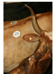
RFID tag in the left ear of a cow in a second tracking demonstration at Lucedale