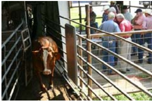
RFID tagged cow walking past a panel reader at Tylertown