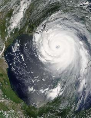
Hurricane assistance program details are available from USDA