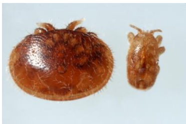
Comparison of Varroa mite (left) and Tropilaelaps clareae (right)