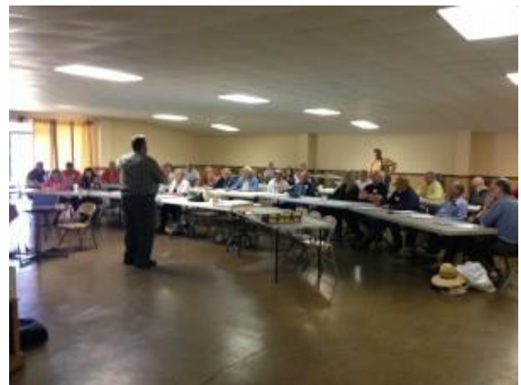
Pike County Fairgrounds Lecture Hall

The importance of young queens and the need to requeen colonies of bees was the third featured topic. Different methods of introducing and releasing new queen bees were shown. Problems with candy or self-release methods were outlined, and the use of push-in cages and hand release of queens was also demonstrated.