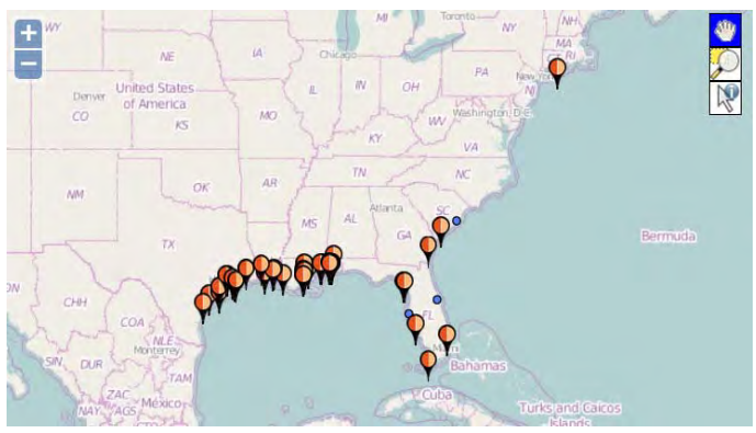
Figure 1. U.S. crab fishermen registered in MarketMaker.