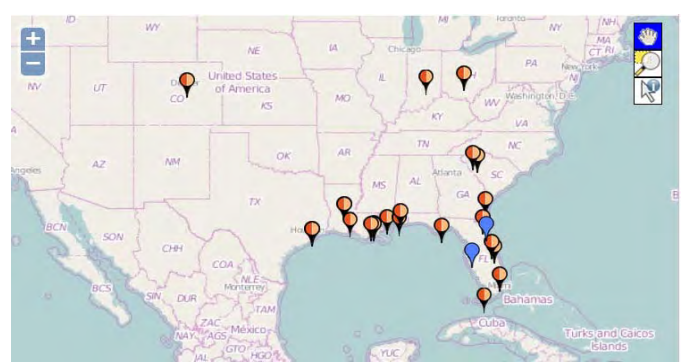
Figure 3. U.S. crab retailers registered in MarketMaker.

The MarketMaker maps above show the geographical locations of the 83 crab fishermen (Fig. 1), 28 crab processors (Fig. 2), 28 crab wholesalers (Fig. 3), and 26 crab retailers (Fig. 4) registered in the national MarketMaker program.