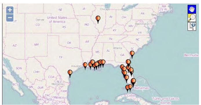
Figure 3. U.S. crab wholesalers registered in MarketMaker.