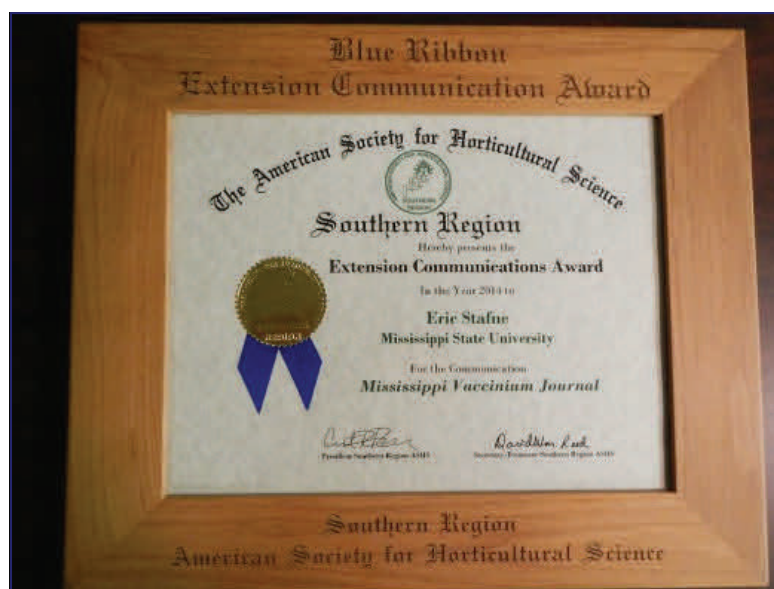
Blue Ribbon Communication Award to the Mississippi Vaccinium Journal