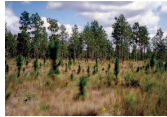
Longleaf pine planted on sandhills

Primary Business Address Mississippi State University Forestry Extension P. O. Box 9681 775 Stone Blvd Mississippi State, MS 39762