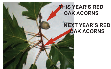
Red oak 2-yr acorn crop ( http://snailstales.blogspot.com )