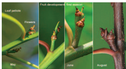
Acorn Development

Make sure to read Delta Hardwood Notes in the next installment of The Overstory to continue learning how to manage for acorn production.