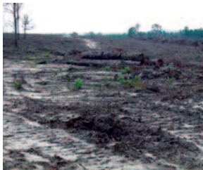
Containerized longleaf seedling (Whitfield Farms & Nursery) Longleaf site prep- Alabama-Coushatta Tribe of Texas (NRCS)

Once high-quality containerized seedlings have been obtained, planting should occur as soon as possible. Typically, the planting season begins in October and ends in March. When possible, earlier planting dates should be selected. However, planting should never be attempted under dry soil moisture conditions. Planting depth is another important factor in establishing longleaf. While optimal planting depth will vary based on existing moisture conditions and anticipated erosion potential, the terminal bud of longleaf seedlings should always remain aboveground, regardless of site. For more detailed information on planting depth, seedling density, or planting techniques for bareroot seedlings, landowners are strongly encouraged to contact the Mississippi State University Extension Service.