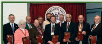
Extension Team Outstanding Customer Service Award Extension Forestry