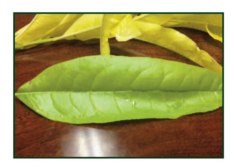
Do You Know What It Is?