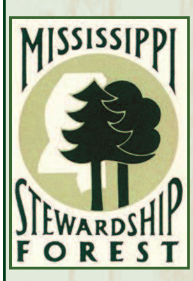
A Mississippi Forestry Commission Program

"Landowners participating in the Mississippi Forest Stewardship Program can enjoy the many benefits derived from well-managed forest while knowing future generations will appreciate a legacy built on the stewardship ethic."