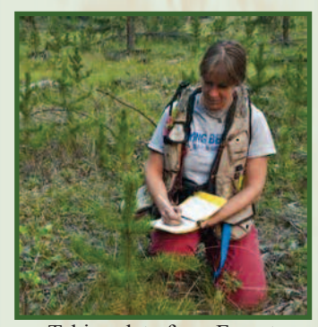
Taking data for a Forest Management Plan