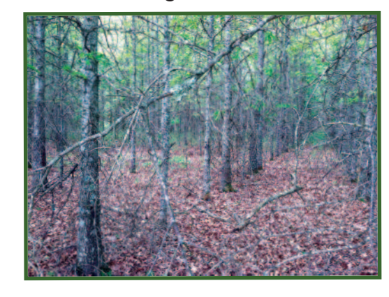
19-yr-old Nuttall oak plantation

Please check http://msucares.com/forestry/index.html for upcoming programming information if you are interested in attending a workshop or short course detailing information in this area.