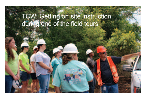
Delta Hardwood Notes