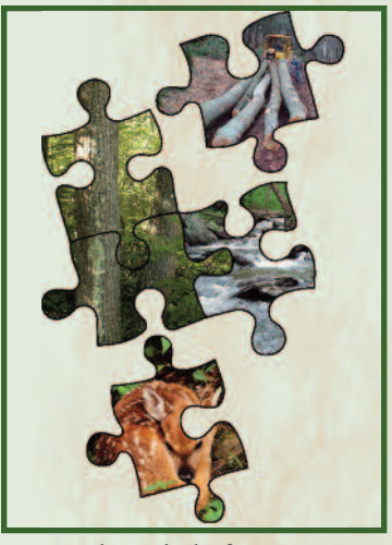
What Kind of Forest Management Plan Do I Need?