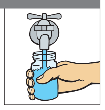
Fill bottle to the required fill line. The fill line will ensure that 100 mls are collected.