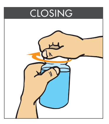
Screw the cap securely on the bottle to prevent leaking.