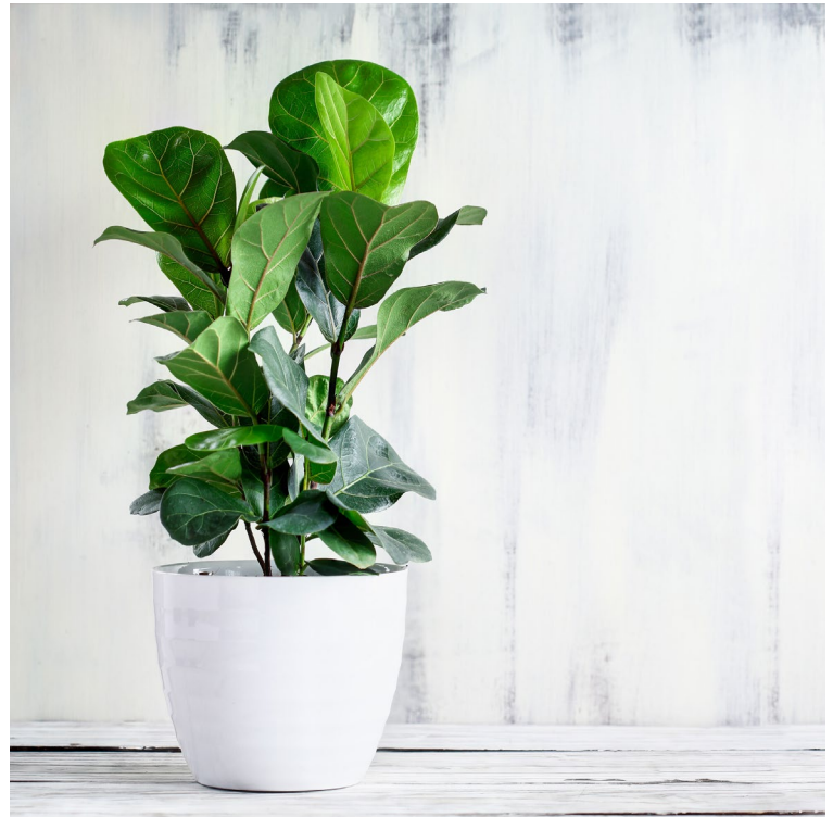
Fiddleleaf figs are popular houseplants that are prone to insect infestations.

Aphids are a bit easier to control than most other houseplant pests because all stages—nymphs to adults—respond to control at any given time. Foliar sprays with a ready-to-use product containing imidacloprid and cyfluthrin or acetimidiprid will usually give fast, effective control. The recommended insecticide table lists several other effective foliar sprays, but good spray coverage is more critical with