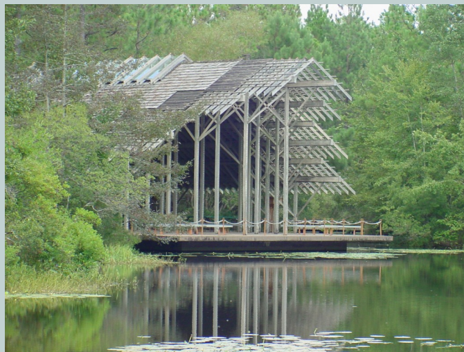
Pinecote Pavilion at Crosby Arboretum, MSU-ES